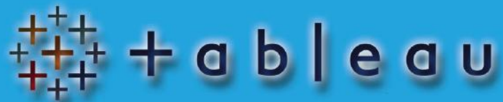
Tableau Online Training provided by Trainer Anand is to ensure you are ready to take up a job assignment requiring Tableau Desktop expertise and covering concepts of data visualization .We provides a deeper understanding of Tableau Architecture and concepts of Filters, Parameters, Graphs, Maps, Table Calculation and Dashboards.

Learn From BI Experts.. Microsoft Business Intelligence (MSBI) Practial MSBI | SSIS | SSAS | SSRS | Online Training