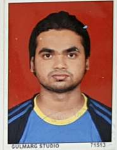
GULMARG STUDIO 71513